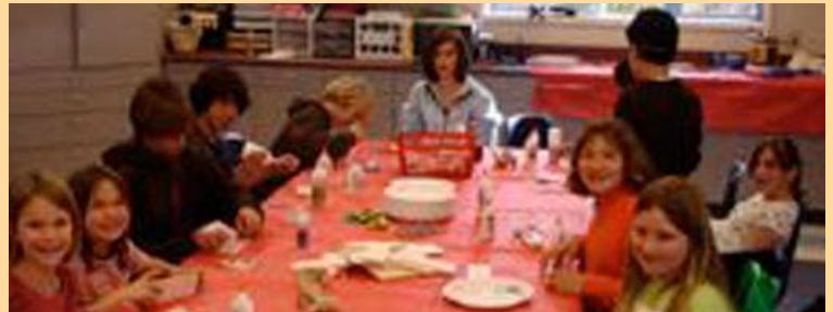
Hannukah and Gelt-making