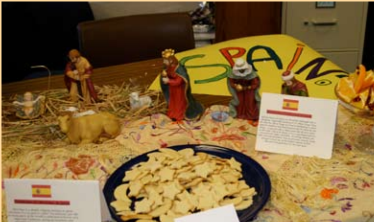
Christmas in Spain