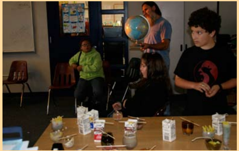
Solstice on Earth