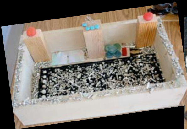
More student sculptures, courtesy of Rachelle Steele